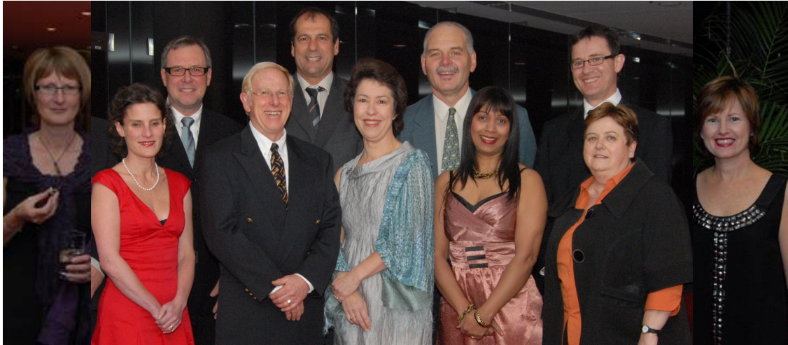
AFAANZ Board 2009