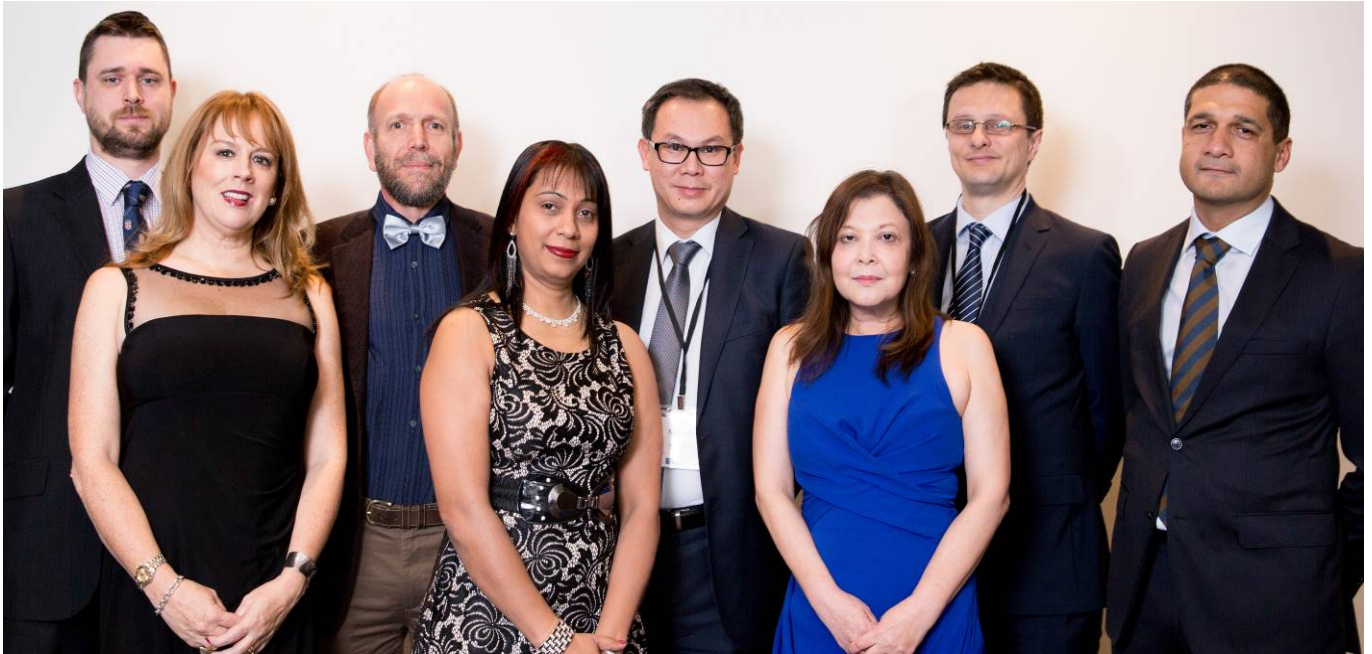
AFAANZ Board 2015-2016