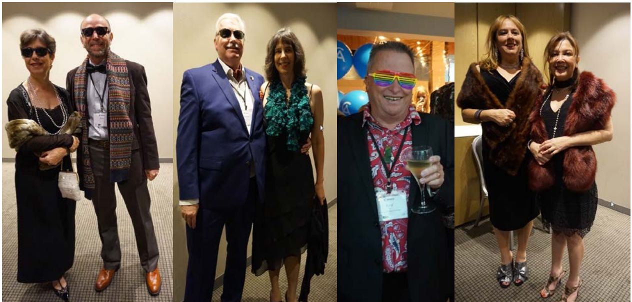
Hollywood Shades & Furs

The Hollywood themed dinner was enjoyed by all!