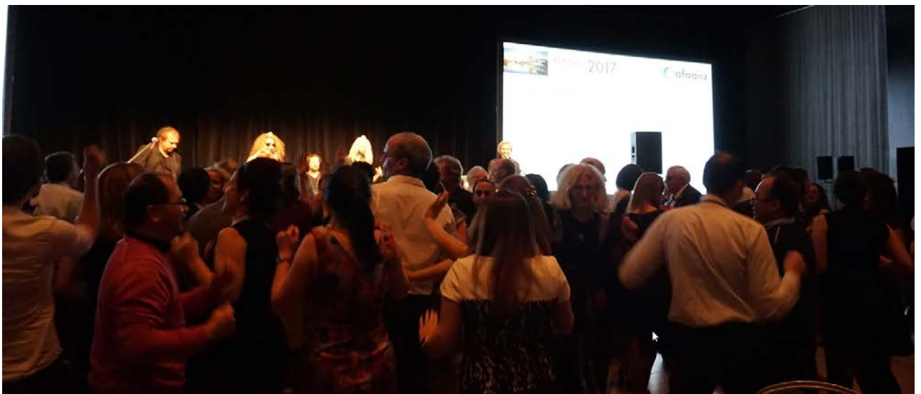
Proof the AFAANZ conference dinner is the place to be!