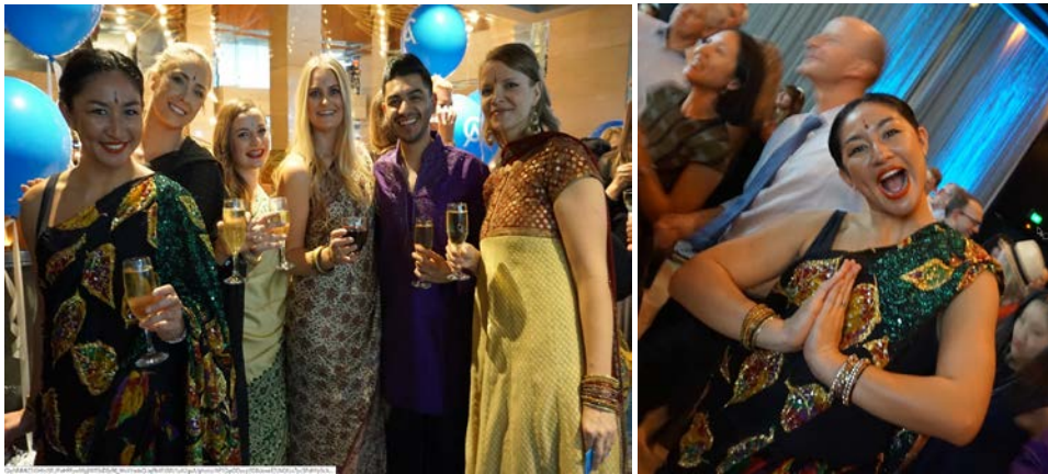
Namaste from Bollywood.